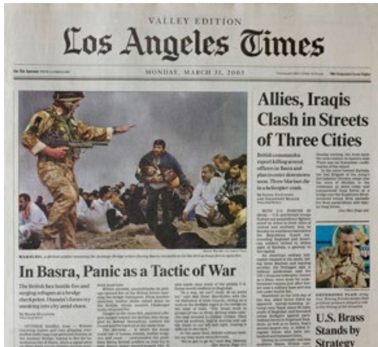
Figure 2. Cover page of Los Angeles Times on March 31, 2003. From “Algunos ejemplos de imágenes manipuladas” (“Some examples of manipulated images”), Jesús de Baldoma; https://fotografialibre.com/articulos/ejembres-imagenes-manipuladas . Copyright: Jesús de Baldoma.