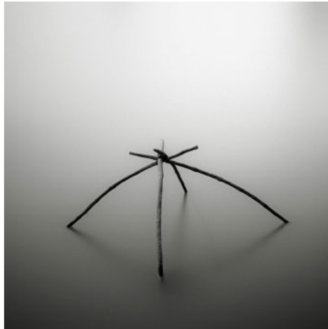
Figure 6. Composition showing “everything” immersed in silence. “Submerge” by Hengki Koentjoro; https://m.facebook.com/koentjoro24 . Copyright: Hengki Koentjoro.

We can see in the second photo (Figure 7) that, rather than using a linear perspective, the foreground and background are layered (as also happens in many Chinese paintings, which never contain a vanishing point). The layers are separated by fog, thus creating a void out of which a landscape is born that ends up fading back into fog (another technique widely used in Chinese painting).