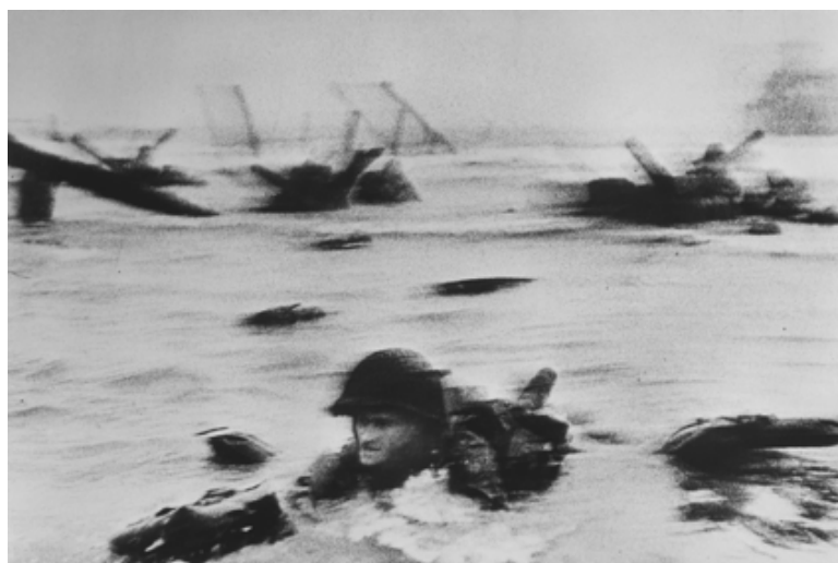
Figure 11. US soldier on the 'D-Day' of the Normandy landings

The last example is a well-known photograph by Robert Capa —one of the few remaining depictions of the Normandy landings (Figure 11). An error on the part of the development technician caused the rest of the shots to be exposed. In this case, the blurring, the objects and the soldier that emerge from the nothingness of the sea (which almost blends in with the sky) provide a plasticity and expressiveness (also due to the contrast between “objects” and void) that transcends the moment and the informative purpose.