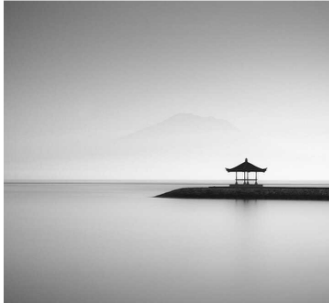
Figure 8. Image of the beach in downtown Sanuar, Bali (Indonesia). “Sanuar Beach”, Hengki Koentjoro; https://m.facebook.com/koentjoro24 . Copyright: Hengki Koentjoro.

Let us now compare the following two photographs, the first by Hengki Koentjoro (Figure 8) and the second by Michael Kenna (Figure 9), who was greatly influenced by Ansel Adams.