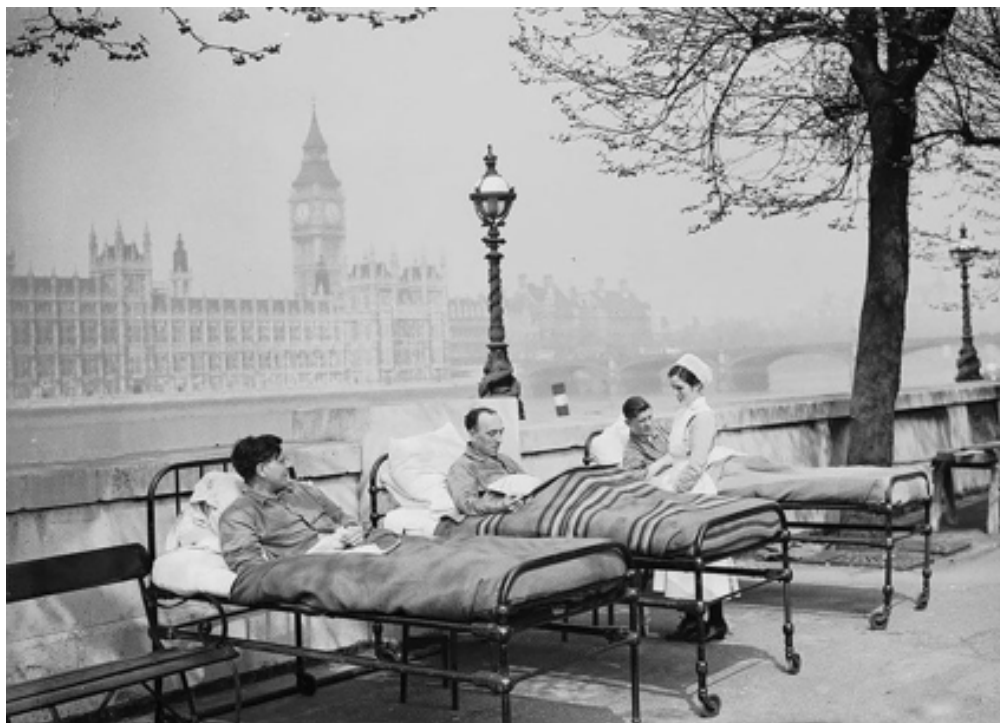
Figure 4. Tuberculosis patients take air by the Thames.

The photograph in Figure 4 depicts a group of patients with tuberculosis (another pandemic) from St Thomas' Hospital lying in their beds in the open air alongside the River Thames. The photo dates from 1936.