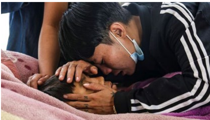
Figure 1. Relatives of a young man mourn his death after he died in the protests against the Myanmar coup.

The third case is the Myanmar Spring Revolution, which occurred in response to the coup d'état instigated by Min Aung Hlaing, Chief of Staff of the Defense Services. In this case, despite the dictatorship's attempts to silence or divert attention, it should be noted that the protests were front-page news across the world. We saw pain because it was shown to us; we even saw the face of death.