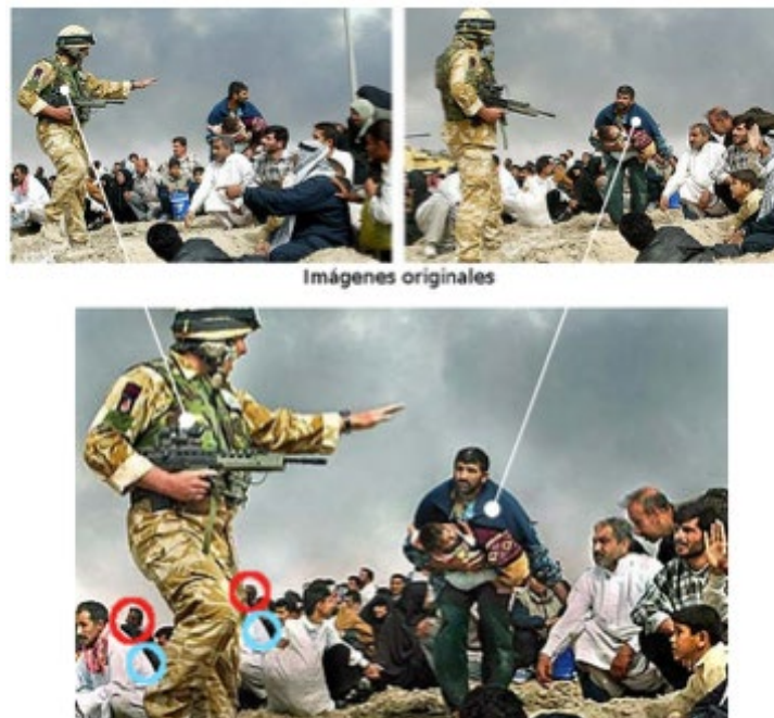
Figure 3. Combination of two photographs to create a third image — Brian Walski (2003). From “Algunos ejemplos de imágenes manipuladas” (“Some examples of manipulated photographs”), Jesús de Baldoma; https://fotografialibre.com/articulos/ejembres-imagenes-manipuladas . Copyright: Jesús de Baldoma and Brian Walski.