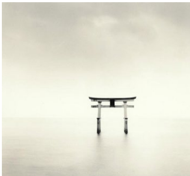
Figure 10. Image of Lake Biwa in Takaishima, Japan, taken five years before the previous one. “Torii, Study 1”